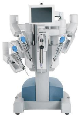
da Vinci® Si Surgical System

expand their skills and improve techniques while heightening the skill level of the entire team at PMC.” The system provides surgeons with enhanced capabilities, including high-definition 3D vision and a magnified view.