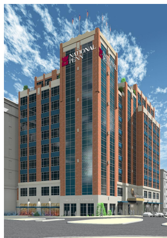
National Penn Bank - Allentown Facility

According to the corporate relocation plan, which calls for no reduction in jobs, the following moves will be completed by fall 2014: