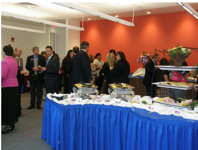
Business Card Exchange at Dale & Frances Hughes Cancer Center

The Dale and Frances Hughes Cancer Center on E. Brown Street in East Stroudsburg was the host of the October Business Card Exchange. What an outstanding facility and we as Monroe County residents, are very fortunate to have them in our community. Everyone in attendance enjoyed the outstanding array of food that was displayed, along with a tour of the facility.