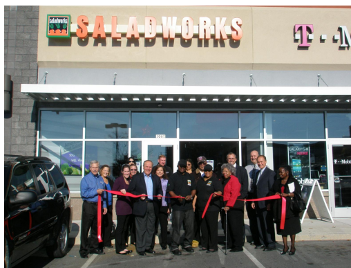
Ribbon Cutting at Saladworks

Saladworks held their ribbon cutting on October 22, 2012. They are located at 361 Charles Way, Suite 107 (Shoppes at Stroud) in Stroudsburg.