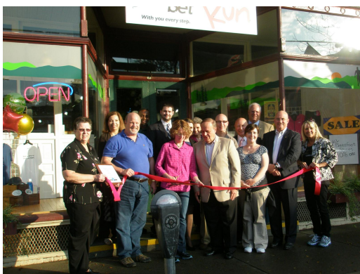
Ribbon Cutting at Ready Set Run

Ready Set Run recently held a ribbon cutting at their new location at 431 Main Street, Stroudsburg. They carry a wide variety of running shoes and apparel for