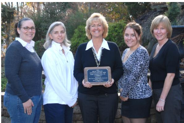
Continuing Excellence Award - Vigon International

If your business would like to participate in the Healthy Workplace Awards for next year, applications will be available on our website in August 2013.