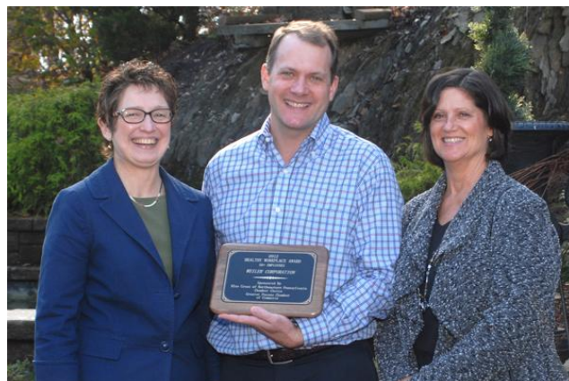
Healthy Workplace Awards (over 100 employees) - Weiler Corporation