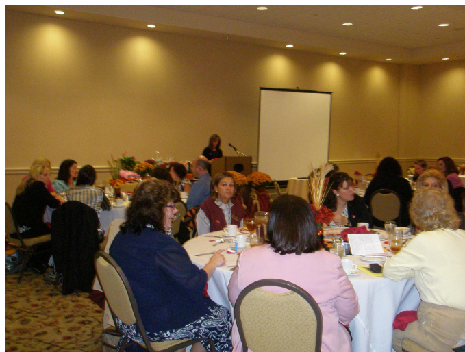
Women in Business October Luncheon at Chateau Resort & Conference Center