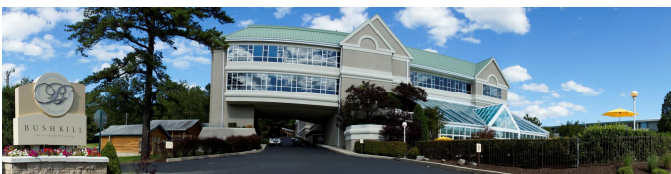
Newly Renovated Bushkill Inn & Conference Center

This newly renovated, beautifully appointed facility is a welcome addition to business owners and their associates. The vision for the renovation was to create the perfect